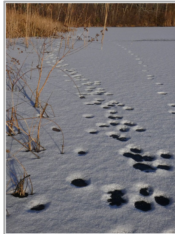
Footprints across main pond in winter

The Refuge has always been frugal in its management, never having more than one paid employee. The latter has traditionally been a manager, living onsite and providing a positive presence throughout the year. Extensive use of volunteers for things like border patrol during hunting 'seasons' or maintaining trails has kept operating costs to a minimum. Administrative management is through a dedicated, all-volunteer Council of Trustees.