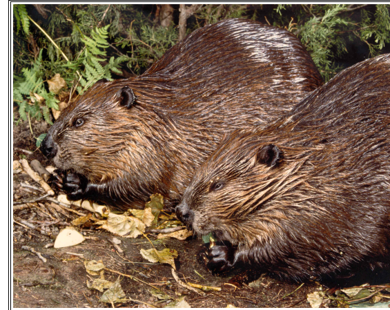
Beavers eating near shore