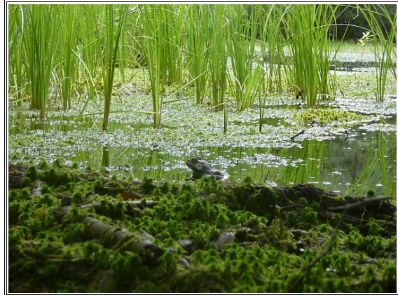
Bullfrog in Muddy Bog

forests, bogs and standing ponds. This provides living opportunities for hundreds of species of amphibians, birds, insects, mammals, reptiles and other animals, and plants. Some are considered biologically threatened (Pine Barrens tree frog), endangered (red-bellied turtle) or scarce