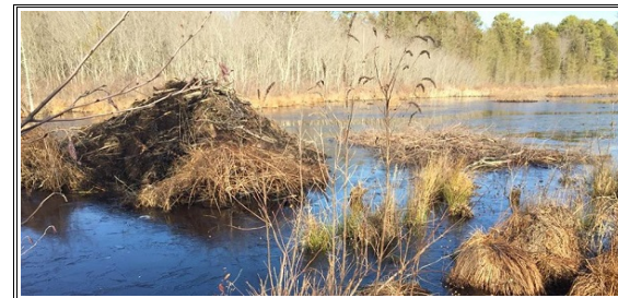
Beaver lodge (left) and food 'raft' (right)