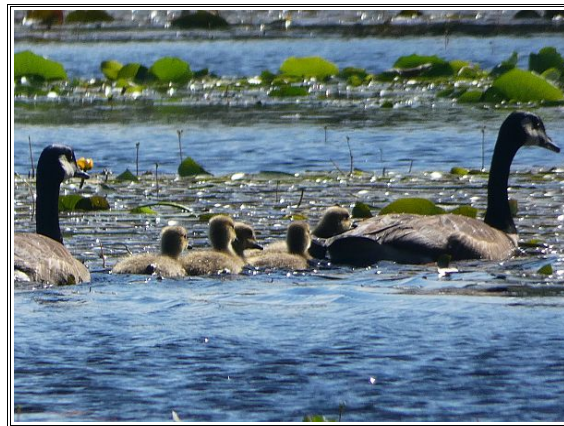
Canada goose family on main pond

From its inception, the Refuge has remained undeveloped and wild, with the exception of miles of nominally maintained and minimally intrusive trails. These trails provide an avenue for public outreach and education as well as protecting the Refuge's borders.