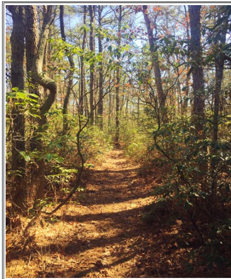
Trail through woods