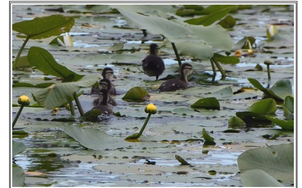
Wood duck babies in main pond